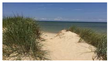
Savage Neck Dunes